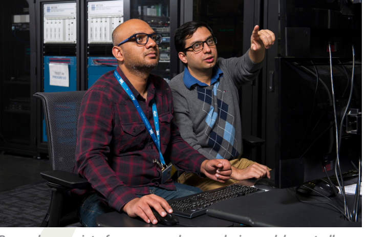
Researchers can interface power and energy device models, controllers and power hardware into digital real-time simulation (DRTS) racks.